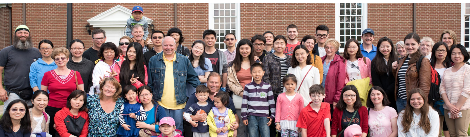
Horizons staff, volunteers, and international students in Albany

It's such a blessing to watch many otherwise ordinary Christians perform extraordinary ministry as they love and serve the students.