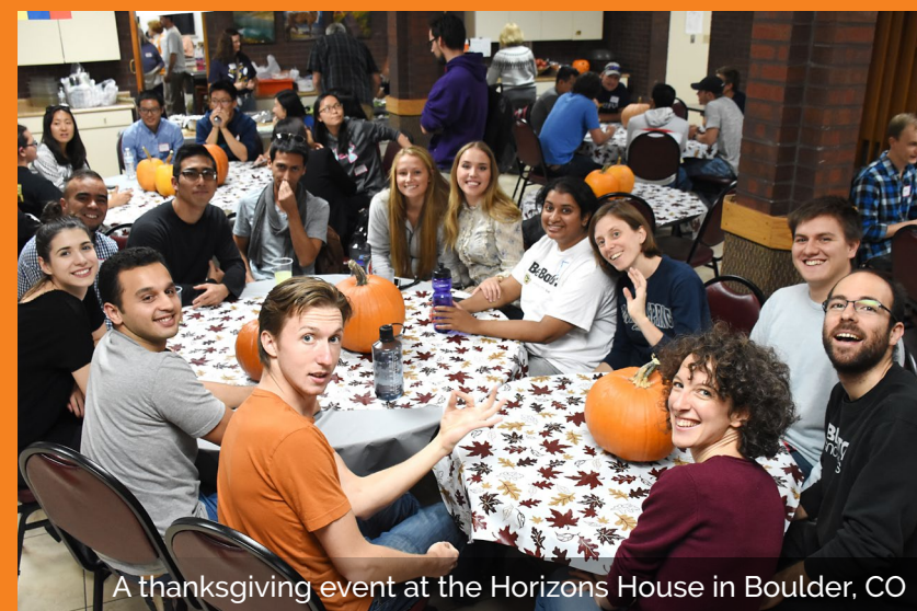
A thanksgiving event at the Horizons House in Boulder, CO