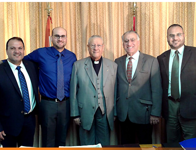
Visiting the President of the Evangelical Council of Lebanon