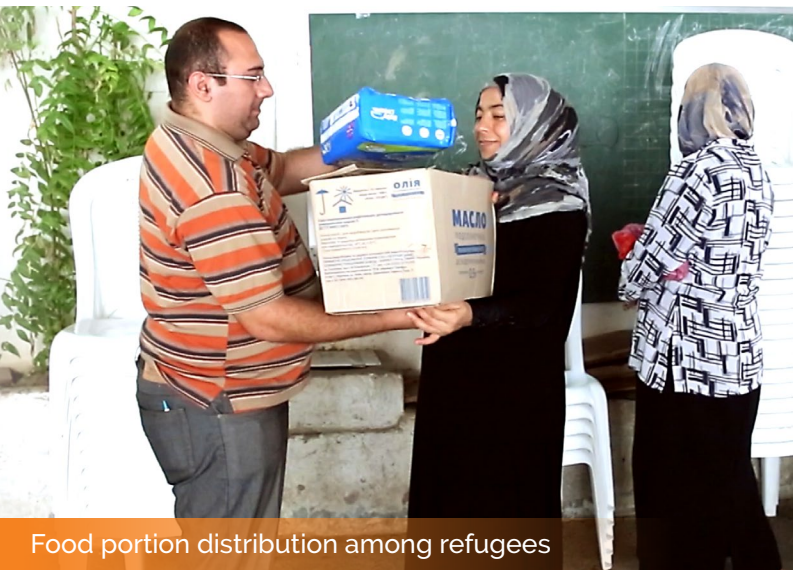
Food portion distribution among refugees

However, surprising as it may seem, when we established Horizons' first center in Beirut, our leader, Pierre Houssney, felt that God was not calling us to be a church! But rather, God was calling us to collaborate with, strengthen, equip, and empower the Church to complete its great calling.