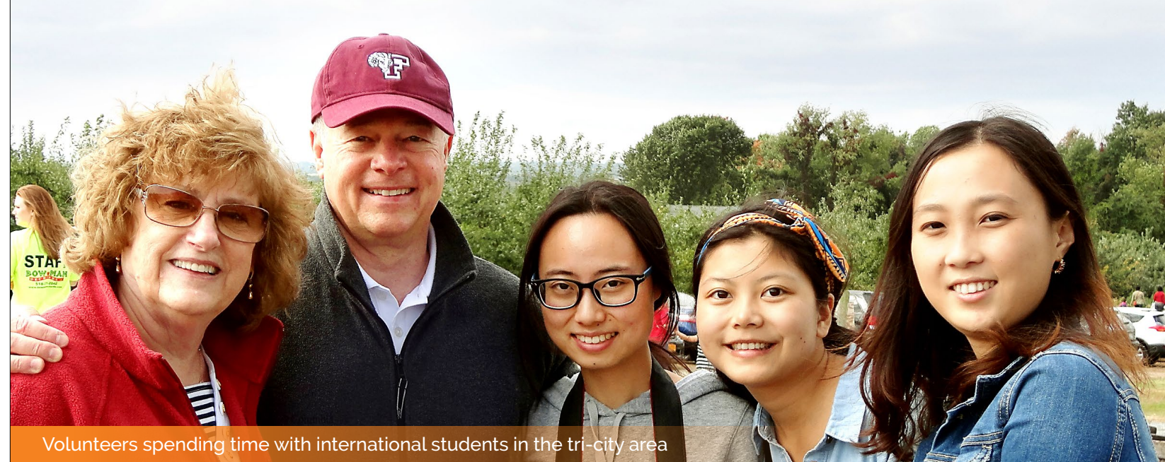
Volunteers spending time with international students in the tri-city area