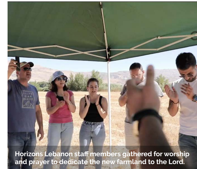
Horizons Lebanon staff members gathered for worship and prayer to dedicate the new farmland to the Lord.

This practical infrastructure is the first piece of a larger missional initiative to sustain and strengthen the local Christian community. Stay tuned for updates on social media, future newsletters, and digital roundtables. Our continued prayer is that God will use the new farmland to bring hope and renewal to Lebanon.