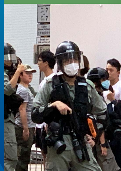
Hong Kong security forces